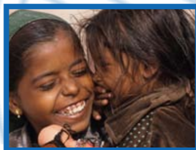
Risas Fondacion CEMIGRA